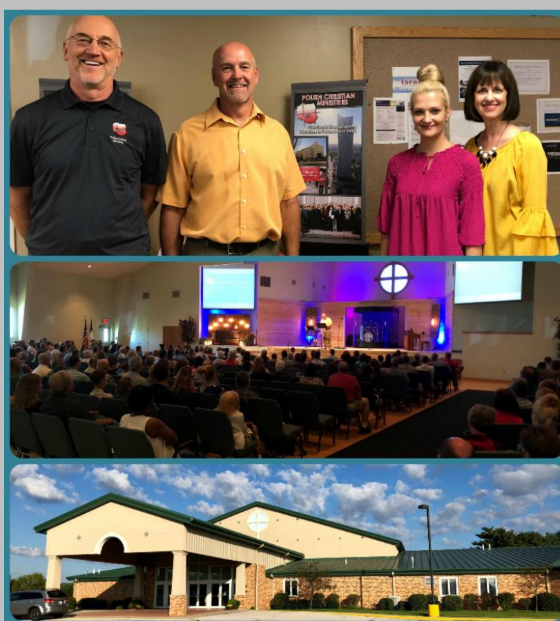
The North Liberty Church of Christ has supported PCM for several years. Currently, they provide full support for the church in Ostroda, as well as providing partial support for the church in Olsztyn. It is always a big encouragement to meet with a church like North Liberty who makes God's work among the nations a priority.